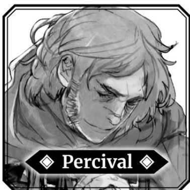
◆ Percival ◆

Moniker: Aether Buster An S-rank adventurer and archmage reunited with his old party member, Belgrieve, by Angeline.