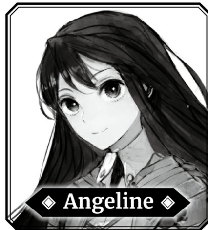
◆ Angeline ◆

Belgrieve's daughter, and an adventurer who has reached the highest rank. She loves her father.