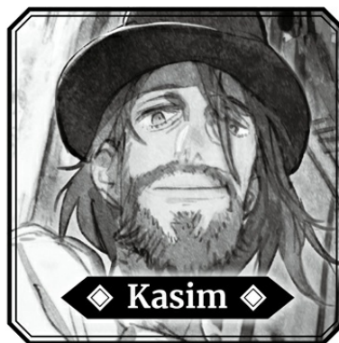
◆ Kasim ◆

An AAA-rank member of Angeline's party who specializes in magic.