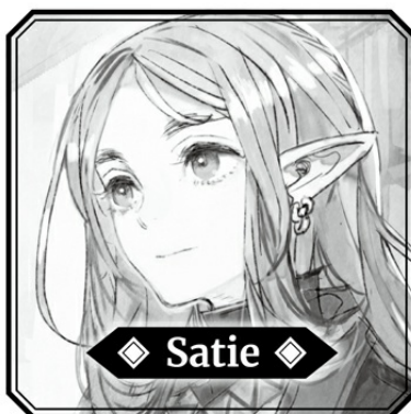
◆ Satie ◆

Moniker: The Exalted Blade An S-Rank adventurer possessing incredible skill with the sword. He was one of Belgrieve's former comrades, and has finally managed to reconcile with him.