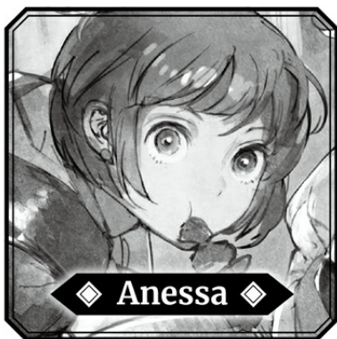
◆ Anessa ◆

The mediator, negotiator, and AAA-rank archer of Angeline's party.