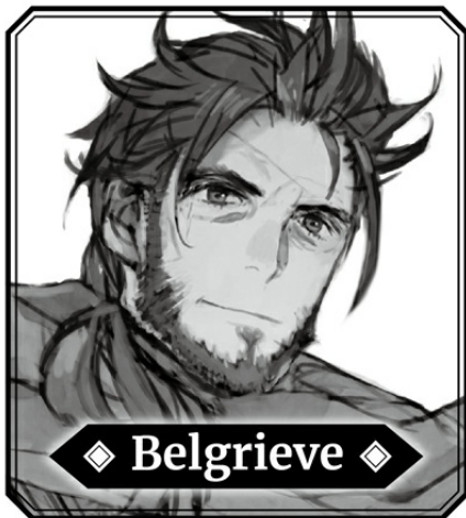
◆ Belgrieve ◆

A former adventurer whose dreams were shattered long ago. He is now on a quest to confront his past.